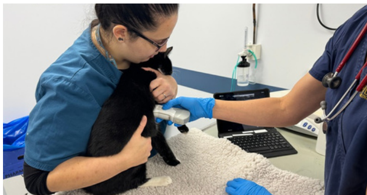
Figure 2: Point of care ultrasound is very useful for identifying effusions. Note the cat is allowed to adopt a comfortable position for the scan

Once treatment is completed, cats should be monitored for relapse by their owners. Signs such as loss of appetite, weight changes, or other clinical signs should prompt reassessment. The clinical signs of relapse may differ from those at initial diagnosis (e.g., neurological signs may be seen in cats that previously had effusions). Ideally, the cat is examined ~4 weeks after stopping treatment, although stress needs to be minimised for the cat, including visits to the clinic. Monitoring AGP may provide reassurance if it remains normal. Any clinical signs should be promptly investigated. However, relapses are uncommon (likely under 5%) and are extremely rare after a month has elapsed after antiviral treatment completion.