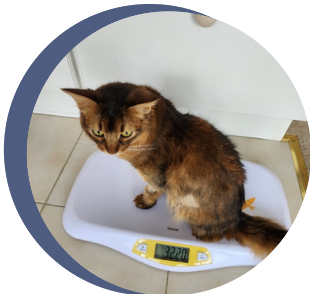
Figure 1: It is important to regularly weigh cats being treated for FIP and adjust the medication dose