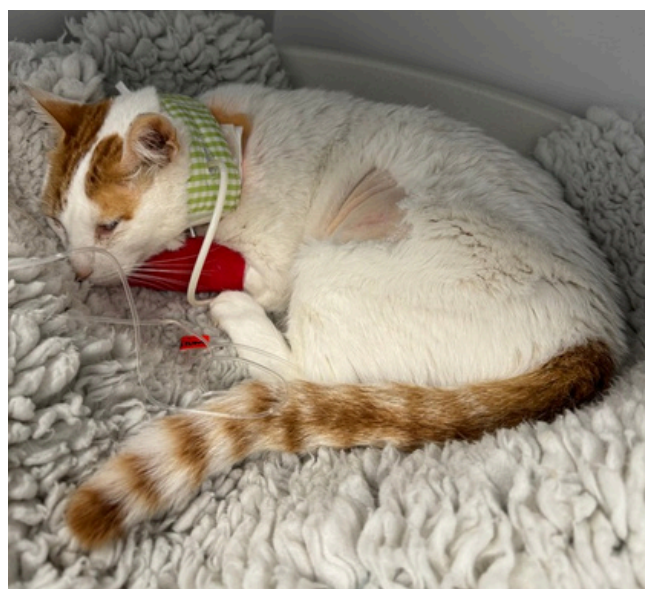
Figure 3: Cats with FIP need additional support, including feeding tubes for nutrition if inappetent